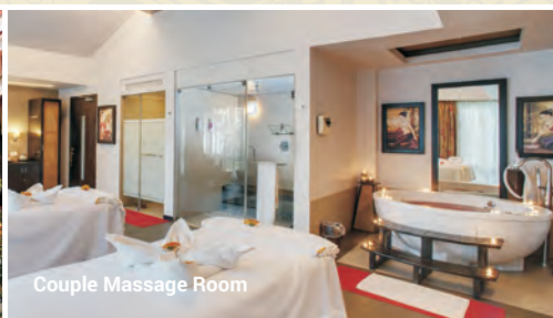
Couple Massage Room