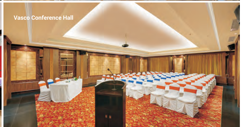
Vasco Conference Hall