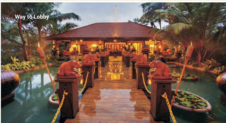
Way to Lobby